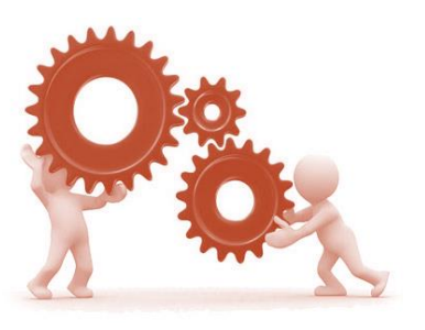
13 projects were awarded